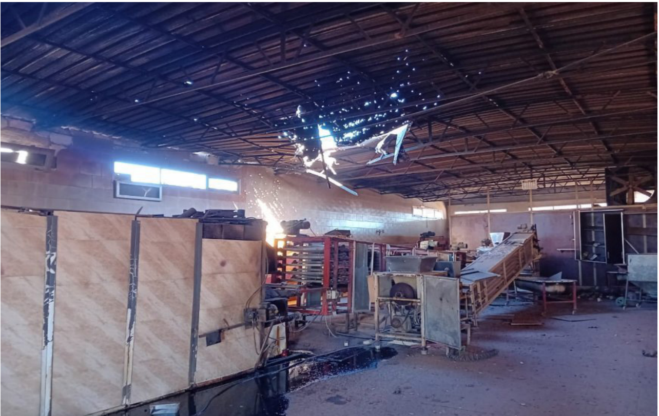
Bakery in Amude bombed by Turkish airstrikes, 24.10.2024

Turkey initiated these airstrikes following an attack in Ankara on October 23, which Turkish authorities attributed to members of the Kurdistan Workers' Party (PKK). No group has claimed the attack. In the past, NES' political and military leaders have stated that Turkey's attacks amount to war crimes and deny Turkey's claims that the PKK stage their attacks from NES.