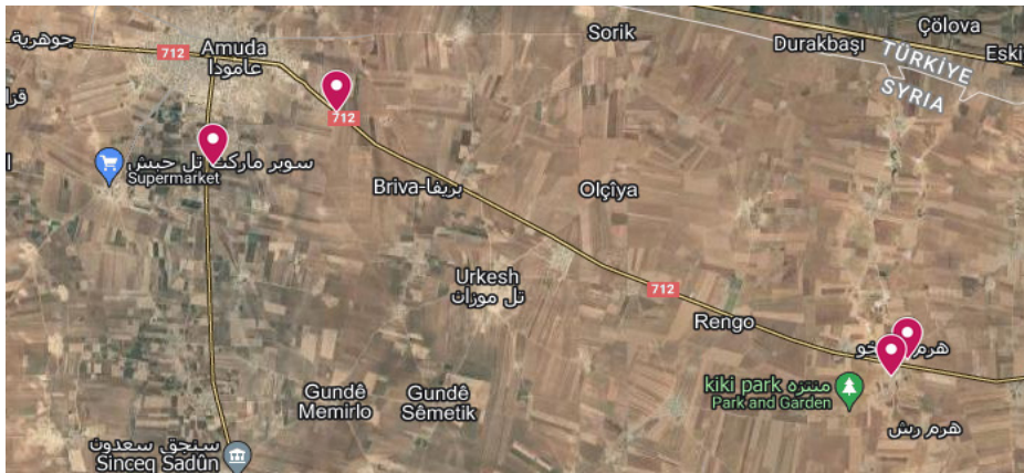
Turkish airstrikes on Amude, 24.10.2024