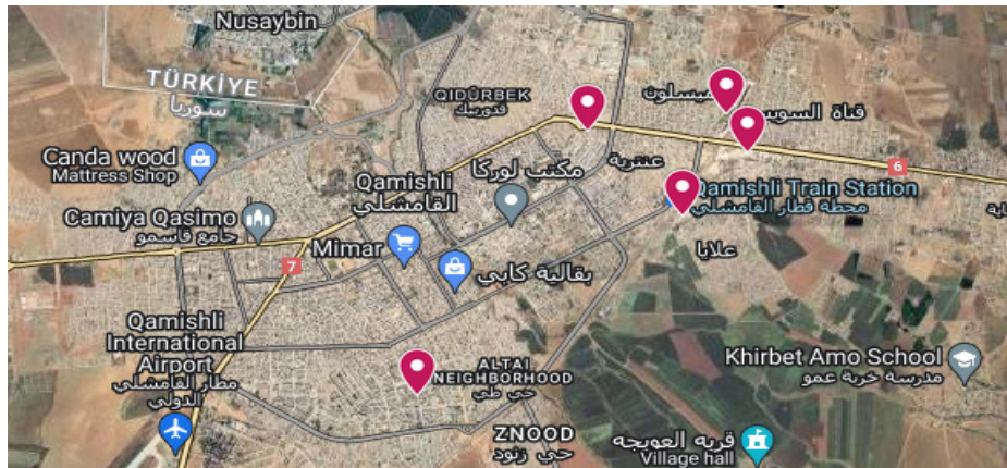
Turkish airstrikes on Qamishlo, 24.10.2024

1. Asayish (Internal Security Forces) Center, Qamishlo; 2. Khalij Health Clinic, Qamishlo; 3. Asayish checkpoint, Qamishlo; 4. Food factory, Kobane; 5. Power station, Amude; 6. Merka Mira, Derik; 7. Kobane electricity station (3); 8. Sadcop Industry Site, Qamishlo; 9. Grain silos, Qamishlo; 10. Saida power station, Tirbespi; 11. Bakery, Kobane; 12. Suwaydiyah gas and electricity station, Tirbespi; 13. Tafla fuel refinery site, Derik; 14. Train station, Qamishlo; 15. Asayish checkpoint, Kobane; 16. Bakery, Amude; 17. Power station, Amude; 18. In the vicinity of the Faculty of Petrol and Petrochemical Engineering, Rimelan; 19. Eyin Tewil, Rimelan; 20. Asayish center, Qamishlo; 21. Babasi station, Tirbespi; 22. Zarba oil station, Tirbespi; 23. Awda station, Odeh oil field; 24. Syriatel tower, Darbasiyah; 25. Odeh oil field, Tirbespi