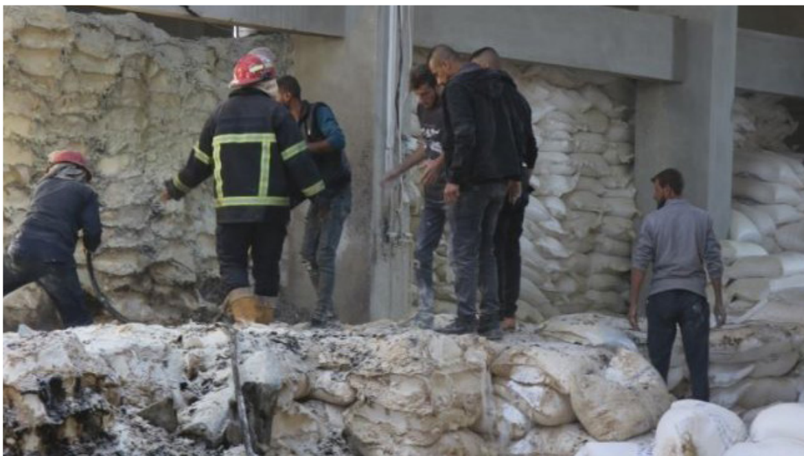
Grain silos bombed by Turkish drones in Qamishlo 24.10.2024