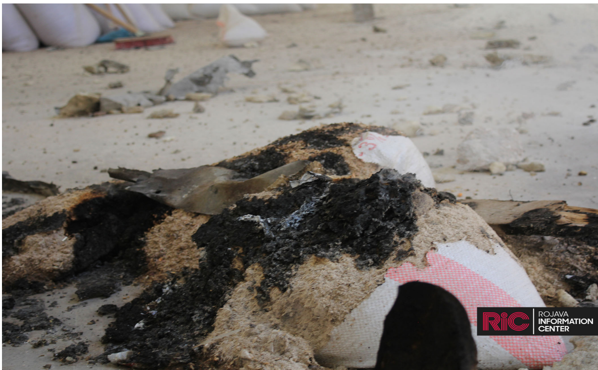
Agricultural Center Company bombed by Turkish drones in Qamishlo 25.10.2024

Today, the armed wing of the Kurdistan Workers' Party (PKK) claimed responsibility for the attack on an aerospace facility in Ankara that took place on October 23rd - after which the most recent round of airstrikes began. The DAANES issued a statement which accuses Turkey of "exporting its internal crises" and denounces "international silence" surrounding the attacks on civilian infrastructure.