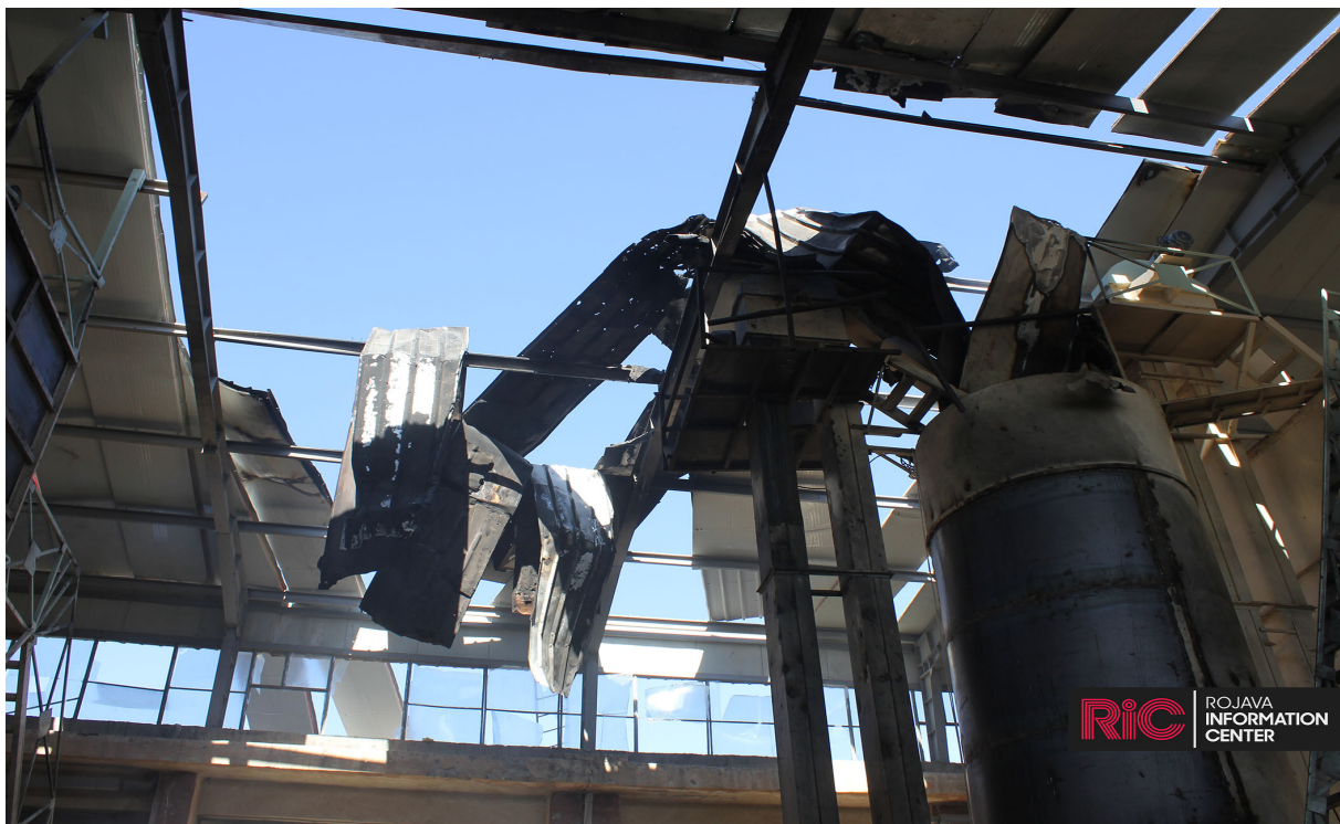
Agricultural Center Company bombed by Turkish drones in Qamishlo 25.10.2024