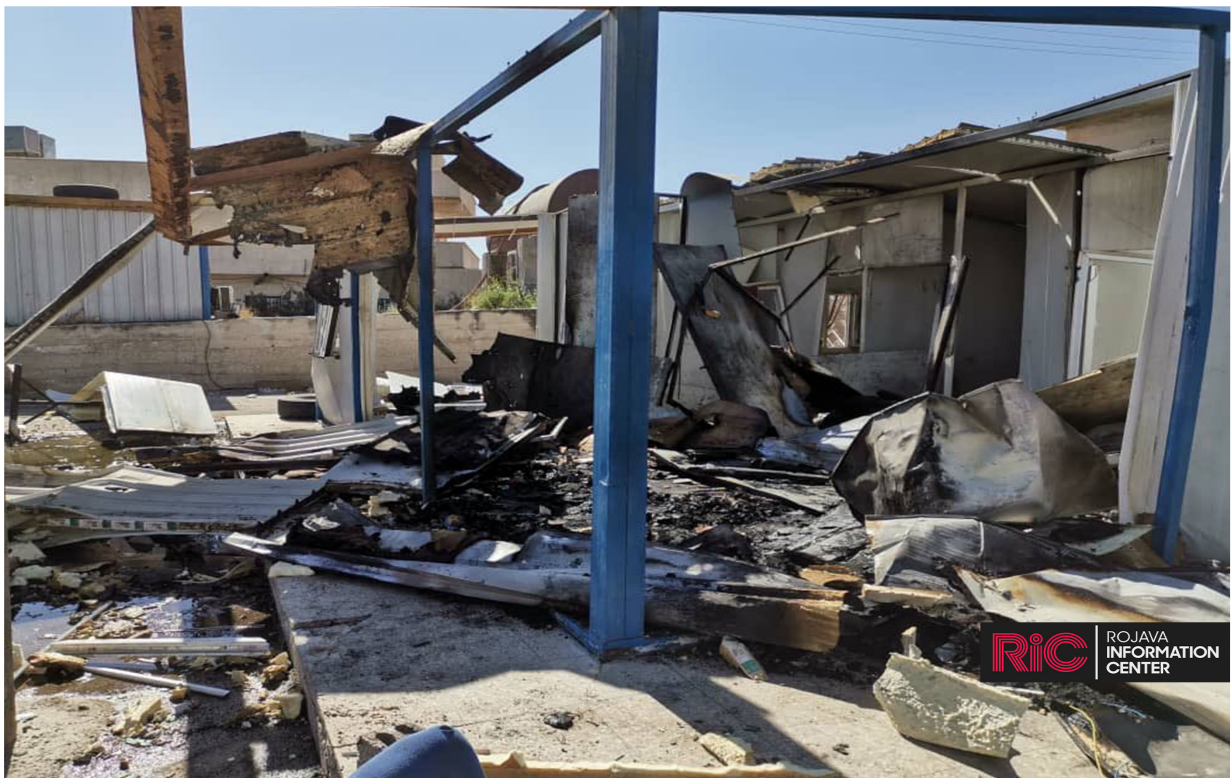
Wheat warehouse bombed by Turkish drones in Kobane 25.10.2024