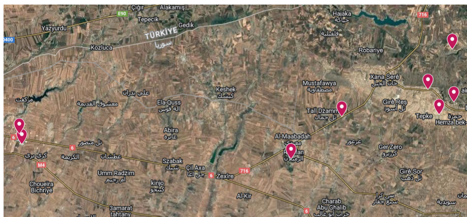
Turkish airstrikes on Derik, Rimelan, and Tirbespi 25.10.2024