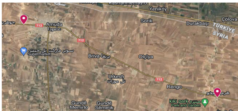
Turkish airstrikes on Amude 25.10.2024