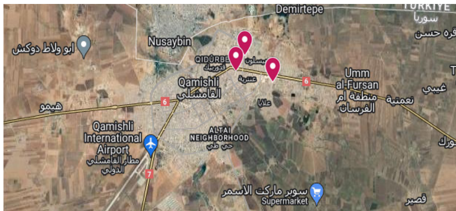
Turkish airstrikes on Qamishlo 25.10.2024

1. City center, Kobane; 2. Asayish checkpoint, Kobane; 3. Odeh oil field; 4. Wheat warehouse, Kobane; 5. Asayish checkpoint, Derik; 6. Kar Qahfak, Girke Lege; 7. City center, Kobane; 8. Agricultural Development Company, Qamishlo; 9. Asayish center, Qamishlo; 10. Sadcop industry site, Qamishlo (2); 11. Plastic bag Factory, Merka Mira; 12. Farm, Derik; 13. Besta Sus, Derik; 14. In the vicinity of Qerechoh, Derik; 15. Asayish checkpoint, Amude; 16. Electricity station, Tirbespi; 17. Sweidiki, Derik; 18. Road junction, Qamishlo; 19. Sawan, Ain Issa; 20. Car maintenance workshop, Rimelan