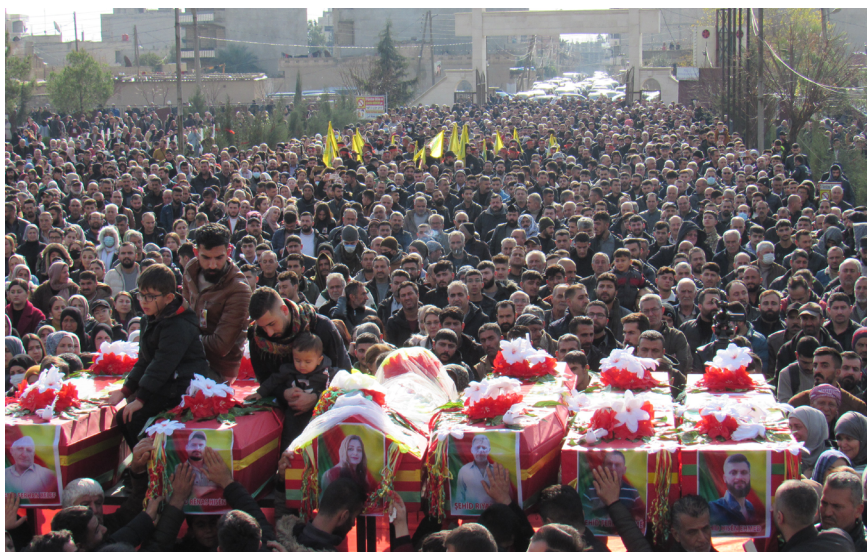
Crowds gather in Qamishlo for the funeral of 6 of the civilians killed by Turkey

-A rocket – likely from Iranian-backed militias – targeted a U.S. base in Shaddadi today; the latest such strike after Iran-U.S. tensions have heightened, with Iranian-backed militias claiming responsibility for over 70 attacks against U.S. bases in Syria and Iraq since October 7th, further threatening stability in NES.