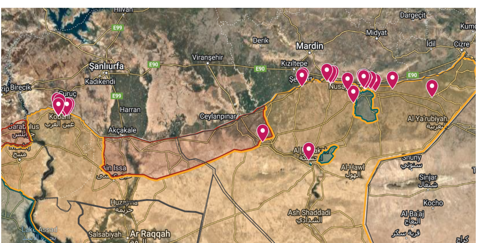
Turkish airstrikes on NES, 25-26.12.2023