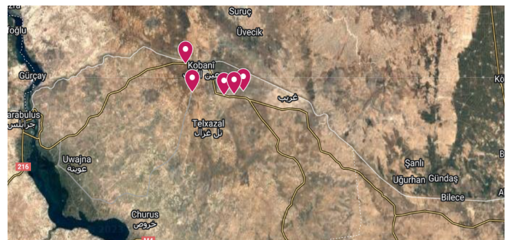
Turkish airstrikes, Euphrates canton, 26.12.2023