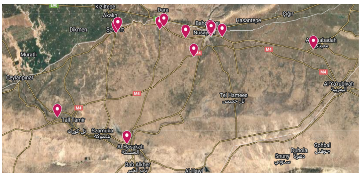
Turkish airstrikes, Jazira canton, 26.12.2023