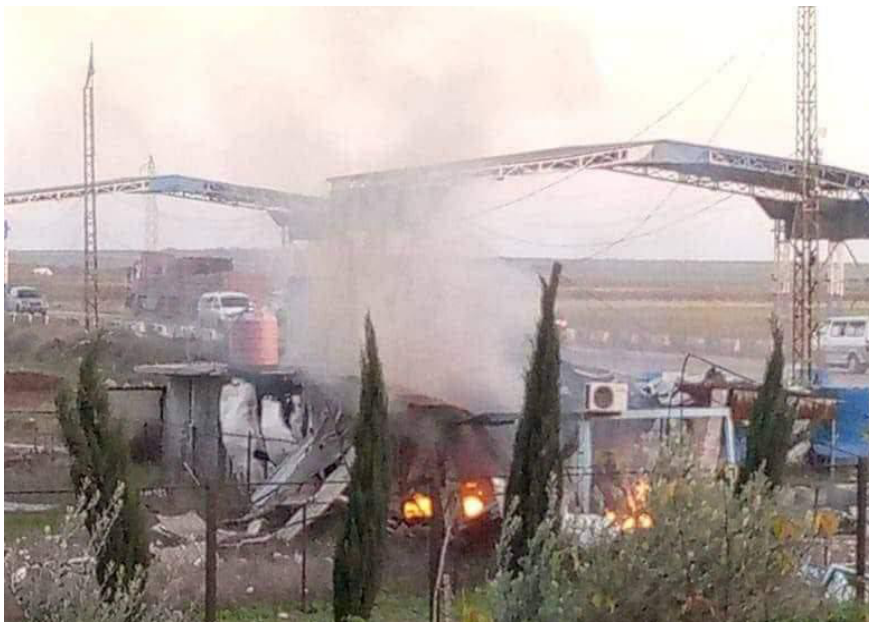
Qamishlo eastern Asayish checkpoint, 26.12.2023

-NES' political and military leaders state that this amounts to war crimes. They have long emphasised that NES' civilian and military institutions are separate from the PKK – contrary to Turkey's claims – and now accuse Turkey of "exporting its internal crises" to deliberately create instability and target the DAANES.