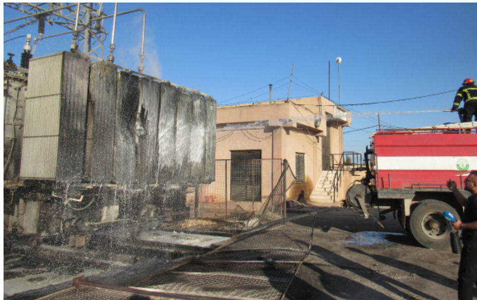
Qamishlo North Electricity Station - fires are extinguished following a second Turkish airstrike on the station, October 6 th , 2023

Energy and electrical infrastructure was Turkey's key target in this campaign. Turkey rendered Jazira region's primary electricity stations inoperable through airstrikes, cutting the general electricity supply for two million people, while also stopping gas bottle and fuel production through strikes on oil and gas field infrastructure. Crucially, NES' electricity infrastructure was already compromised prior to Turkey's campaign, and fuel and gas shortages were commonplace across NES. Turkey has deliberately worsened an already poor humanitarian situation.