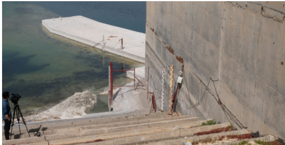
Tishreen Dam, Euphrates River - low water levels curb electricity generation, March 2 nd , 2023

Turkey's targeting of Amude's electrical station left Alouk water station without power on October 5 th . Amude's station provides electricity to the Darbasiyah transfer station which then routes it to Alouk. Alouk had only just resumed service with some limited water provision, after an almost year-long closure. 22,23 Turkey's recent attacks cut water output from the crucial station again. Meanwhile, Turkey strikes close to the Himme water station in Heseke city triggered a staff evacuation, halting operations at the station temporarily.