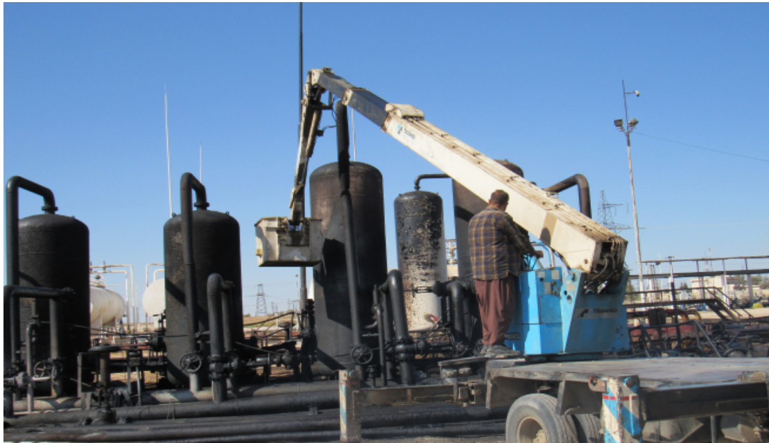
Suwaydiyah gas and electricity station - repair works commence, October 7 th , 2023