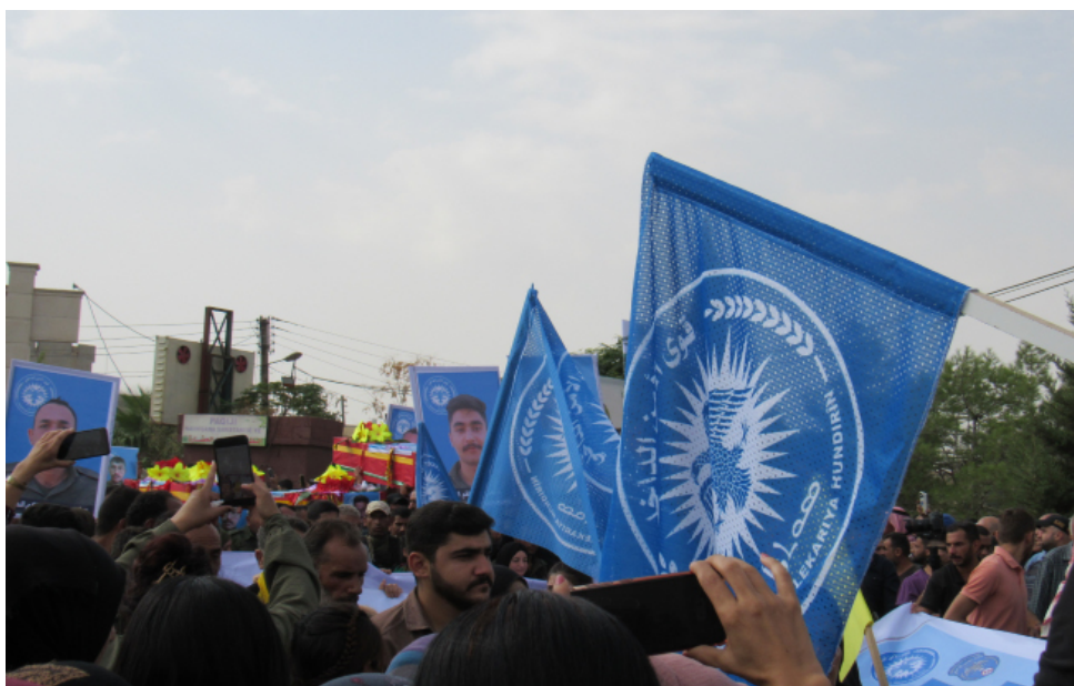
Qamishlo - crowds at the funeral of the members of the Asayish anti-drugs branch killed in Turkish airstrikes on the night of October 8 th .

alone. 43 Despite promising to step up its efforts in curbing the captagon trade upon its re-entry into the Arab League, the Syrian government's approach to the drug trade has run into questioning from its Arab League partners. Since Syria's re-entry into the Arab League, the Jordanian state has consistently accused the Syrian government and its Iranian allies of complicity in the drug trade, which often finds itself flowing into Jordan from government-held areas of Syria. 44 In September, the Arab League suspended meetings with the Syrian government, with reports citing an impasse on managing the drug trade. 45