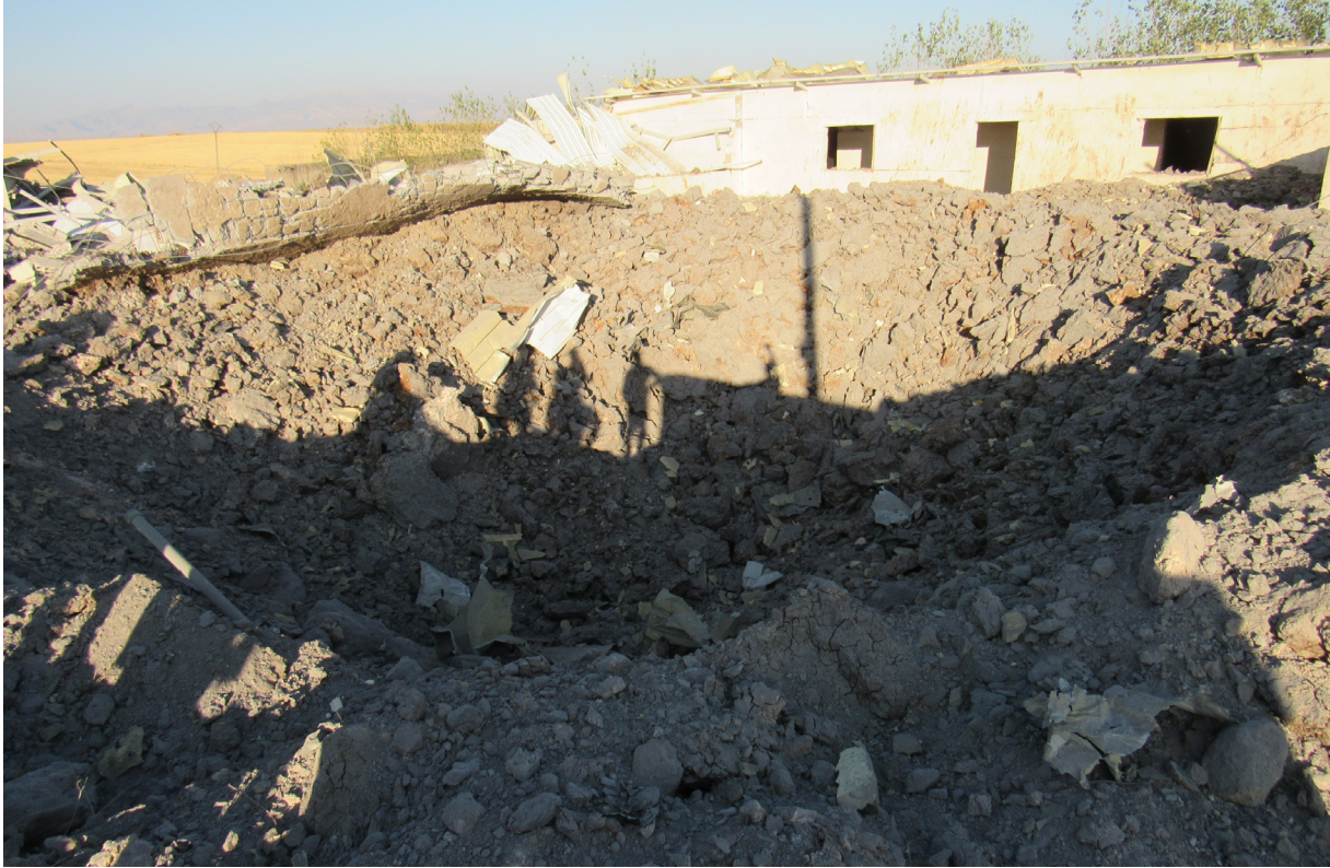
Derik, COVID-19 hospital facility - crater following Turkish airstrikes, October 7 th

sale.” Menendez is currently facing corruption charges and is thus unlikely to retain his responsibilities on the Senate Foreign Relations Committee, leaving the F-16 modernization deal with an easier path to passage. 64