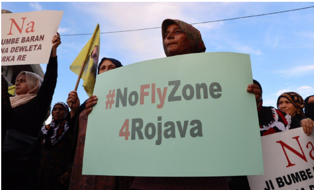
Qamishlo - city residents call for a "no fly zone" following Turkish airstrikes, October 6 th , 2023

Quantifying the immediate impacts of Turkey's airstrikes - such as total material losses, costs of infrastructure repairs, or financial accounting for oil revenue drops - proved challenging, as estimates varied greatly. While those figures made available to RIC are included in this report, several AANES officials told RIC that it was currently difficult to make calculations with certainty. In addition, the humanitarian impacts of Turkey's October campaign will be most keenly felt in the medium to long term, as yet another layer of the multi-faceted war waged by Erdoğan against NES, its population, and the AANES and SDF. In light of this, beyond giving a sector-by-sector account of the principle effects of Turkey's campaign, in this report RIC has sought to also present a picture of some of the underlying difficulties NES is facing - humanitarian, security, and political - and review how Turkey's attacks will further these crises.