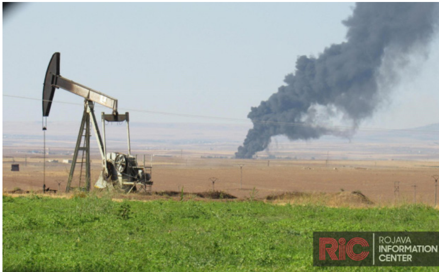
Turkish airstrike on oil well near Girke Lege