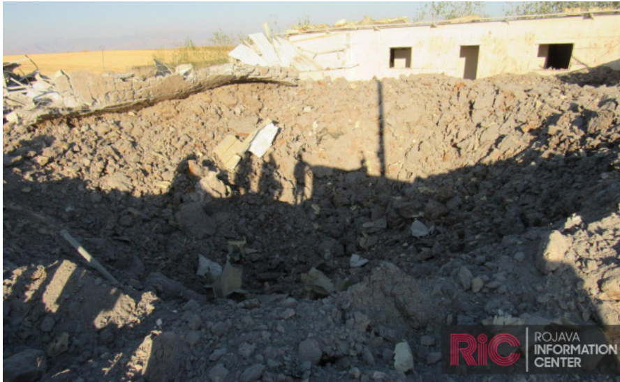
Crater left by the airstrike on the Covid-19 hospital facility near Derik.