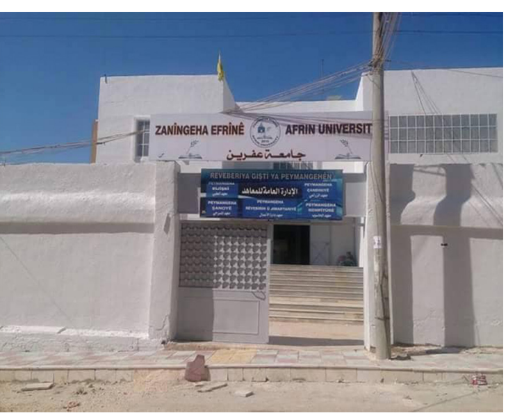
Afrin University (pictured) was established in 2015 and was forced to close as Turkey invaded the region in 2018. Today the building houses the Afrin Council, a Turkish proxy government in the region.

The war situation has deep implications for the universities' functionality, even when they are not directly under attack. Basic resources, such as electricity or fuel to run generators, are in short supply. "Students and teachers can't work, because the internet is so bad," says professor Ayo, "if we have online classes, we can't do that. But also if we want to research, to do projects, to download books, to contact colleagues or to hold meetings, it is difficult. If we don't have the internet, everything stops."