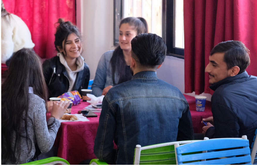
Students enjoy a coffee at Rojava University's cafeteria.

Student housing in Qamishlo, Kobane, and Raqqa is provided free of charge to all student. In Qamishlo, around half a dozen student residence buildings are found across the city; over half of them are for female students. In each residence, 3-8 students share bedrooms and form a 'commune', which has to