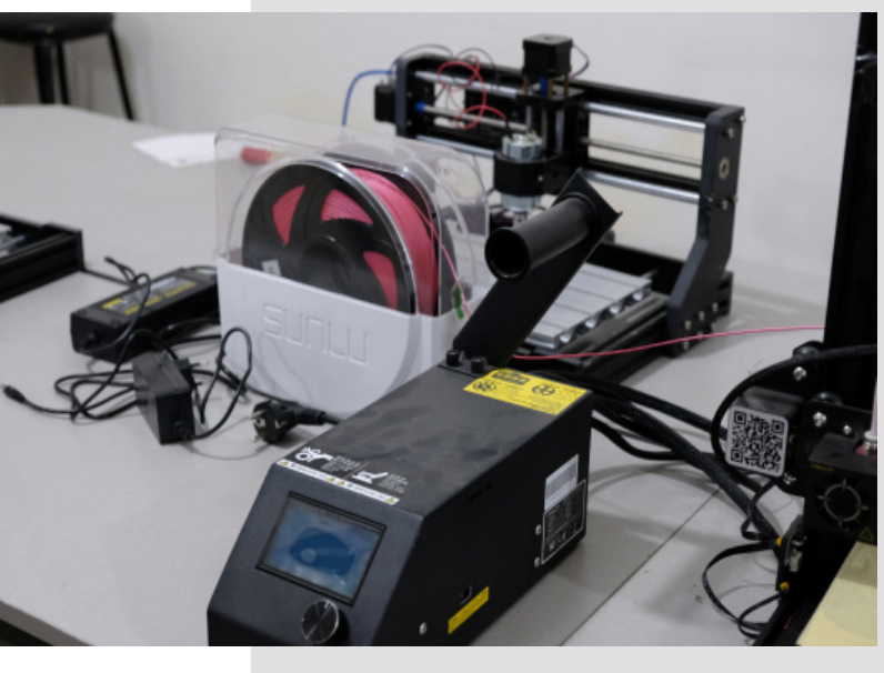
3D printer at the Rojava University Mechatronics department.

Professors Basil and Siham showed RIC different projects designed by third-years students: A firefighting car containing built-in sensors that are able to detect fire; a small scale 'smart house' controlled from a mo-