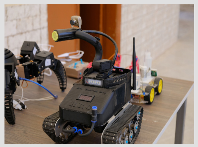
Final projects of 2022's Mechatronics students, including a fire-fighting robot, spider robots, and a drone.

However, aspirations for autonomy go beyond the material. Closely mirroring the values of autonomy of the AANES system and the university, the professors stress the need to be able to develop their own technological systems, free of outside influence. While RIC visited their basement, the professors were engrossed in a discussion about the use of readymade single-board microcontrollers, and the better alternative of using un-programmed microcontrollers, programming them at the Mechatronics Department, and using them for their own purposes.