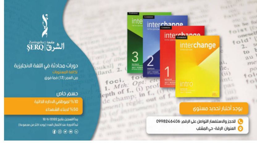
years." To this end, the University's ployees of the AANES receive a 10% discount, while children of soldiers fallen in battle only pay half price.

Already, al-Sharq boasts over departments of Social Sciences, Biology, Chemistry, Education, Computer Science, English Language, and Arabic Literature. More departments are planned in the future. The university also places a great emphasis on its alumni being able to speak English. "The aim is for everybody [at al-Sharq] to be able to speak English in four or five Language Institute also offers ex-