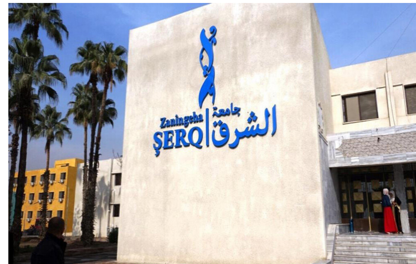
international recognition of Stu- Entrance of al-Sharq University in Ragga. A student residence building is visible in the background.

However, the main hurdle remains dents' diplomas. While the quali-