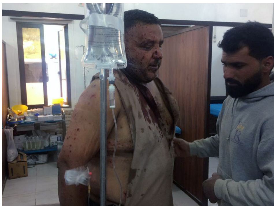
he attempted to return to his home on 22 October

“At Mishrafa, we took the non-concreted road [moving west off the main road]. We were driving as normal on the motorbike when there was a blow on my face. Something exploded and the world fell apart.” He and Ednan came around lying on the floor with the motorbike destroyed, and crawled back to the main road where they were able to flag down another car to bring them to Tel Tamer hospital. His account likewise indicates that Turkish-backed forces have been targeting civilians in circumstances where they could not be