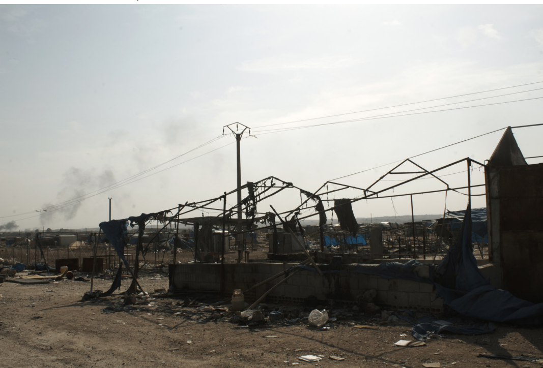
Damage in the Ayn Issa camp, where 13,000 civilian IDPs were forced to flee by Turkish shelling