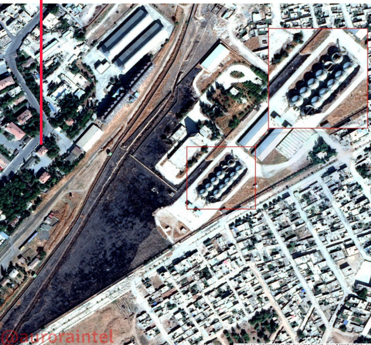
Satellite imagery shows partial damage to grain silos in Sere Kaniye during the opening days of the war

omous Administration. 33 Eyewitnesses also confirmed to RIC the shelling of churches in Qamishlo and Tirbespiye and schools across Sere Kaniye and Tel Abyad, in addition to the targeting of hospitals outlined below. 34 Though it is difficult to get an accurate picture of the scale of destruction within the zones of occupation, the UN has documented the targeting and partial or complete destruction of 20 of 150 schools in Sere Kaniye district, giving some indication of the total but not absolute destruction of infrastructure in this region. 35