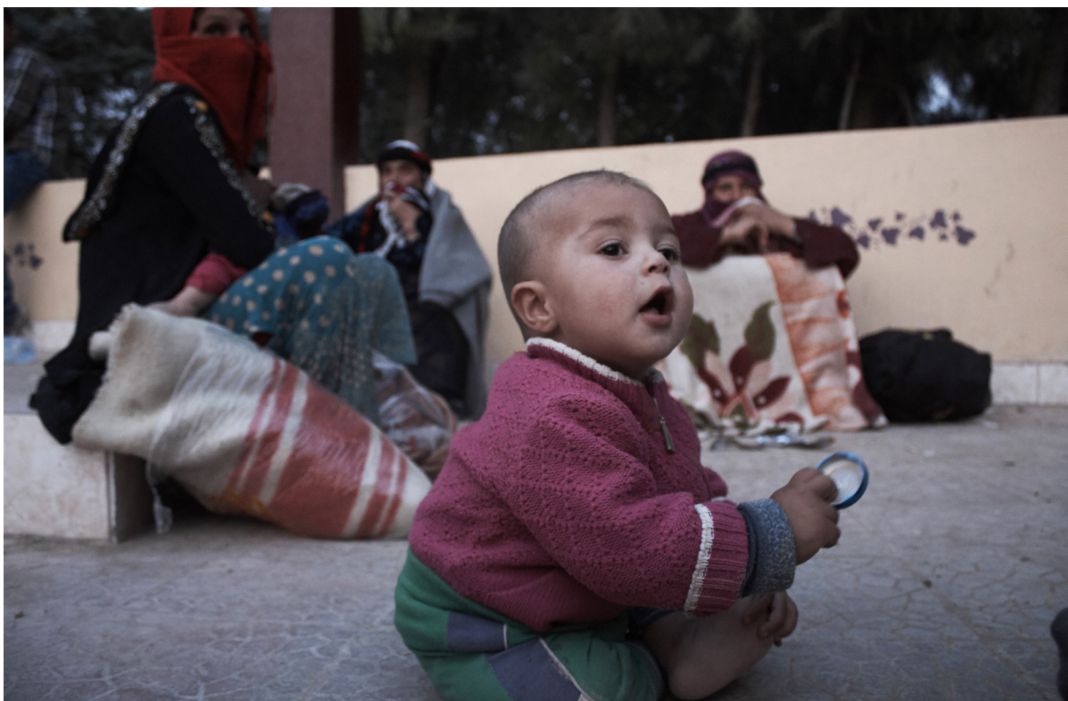
Women and children displaced by the Turkish invasion sheltering in a school in Hasekah

Secondly, and linked to these observations, the Kurds who have borne the brunt of the invasion should be understood as a regional minority group being subjected to forcible demographic engineering. The violence targeting civilians identified throughout this report should be contextualized as part of an intentional effort on Ankara's behalf to drive the Kurdish population in particular from the border regions, in order to facilitate a program of forced demographic change which some experts say "shows the hallmarks of ethnic cleansing." 71 International actors should consider the violations detailed in this report in the context of President Erdogan's domestic and regional political program, and his assertions that Kurds 'do not belong' in their ancestral homeland.