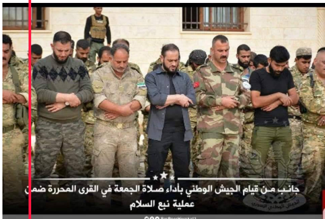
1The home of a prominent local doctor was seized and converted into a mosque by TNA fighters

“First, they contacted me via an Arab acquaintance. He said that the proxy forces had found SDF papers belonging to my son, but that it didn’t matter, I could come back. He said they wanted to sell me back my own goods for $700,000 [USD].