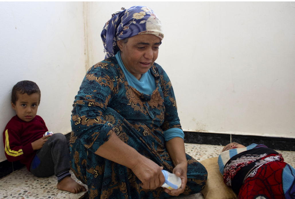
IDPs in Tel Tamer described ongoing water shortages as of 24 November

Per UN figures, the strike on the Allouk pumping station left 450,000 people without access to water, with 22 out of 34 pumps put out of service. On the 29 October, powerlines leading from Dirbesiye to the station