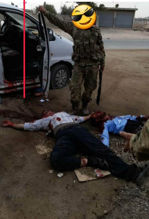
Photograph of a TNA fighter posing with the bodies of killed civilians [face obscured in original], sent to their families to demand ransom