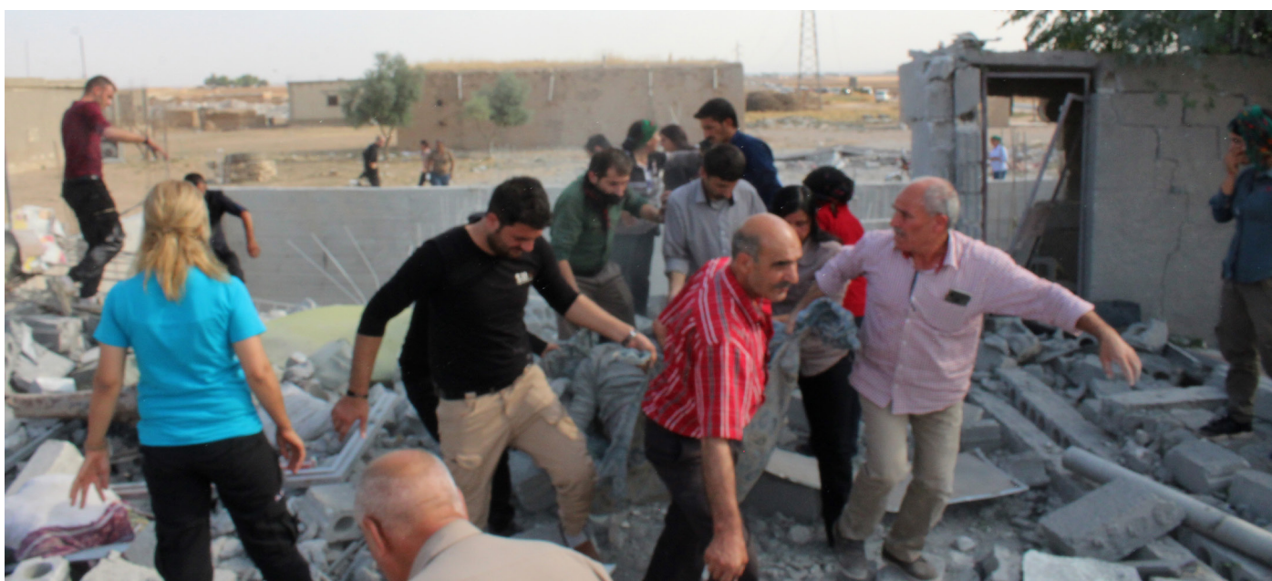
Retrieval of bodies in Mishrafa, south Sere Kaniye, on 18 October