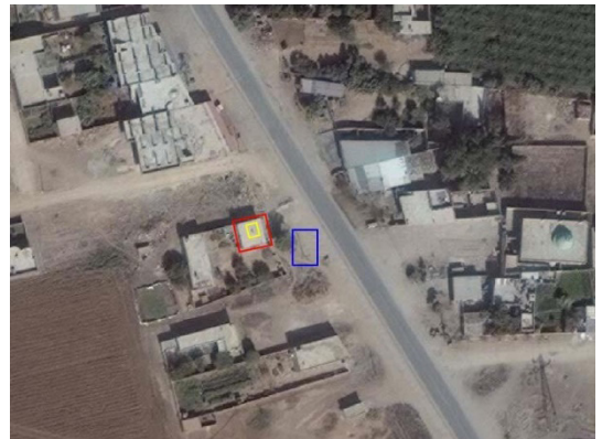
The blue box indicates where three bodies of civilians killed by TAF were photographed and sent to the victims' family

Following rescue, Mr. Sino was transferred to hospital in Hasakah where his wounds were treated, but the other three passengers were killed.