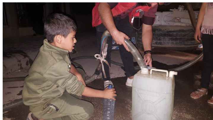
Water distribution in Hasekah city