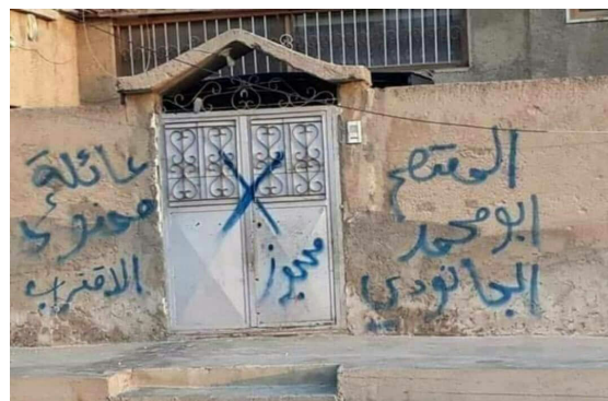
House in Sere Kaniye marked as the property of TNA faction Liwa-al-Mutasim, with the graffiti declaring the owners “forbidden to return”