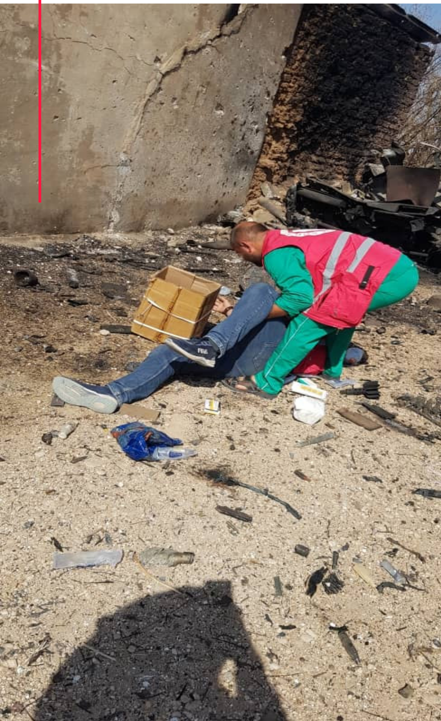
A Kurdish Red Crescent worker helps a colleague injured in a Turkish air strike

my colleague who was driving were wounded... it is difficult for us to reach the wounded and evacuate them. The Turkish drones strike civilians and ambulances.”