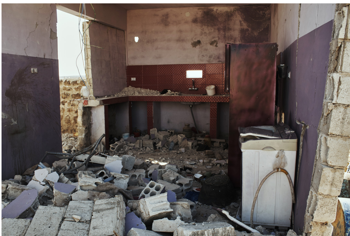
Civilian home in Siftek, west Kobane region, destroyed in Turkish shelling

We began by compiling a database of rights violations for which there is either i) reliable photographic or video evidence or ii) eyewitness testimony collected by our field teams. While by no means comprehensive, this database of over 150 incidents gives a broad picture of rights violations throughout the conflict. Working with this information, we were able to define the four categories listed above. You can find the full database on the Rojava Information Center website via the link below 5 .